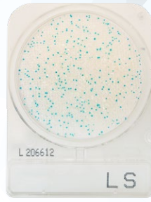
Listeria Cat. no. LS100