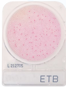
Enterobacteriaceae Cat. no. ETB100