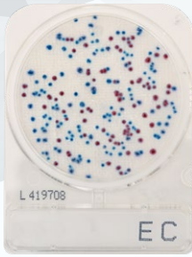
E. coli and Coliforms Cat. no. EC100