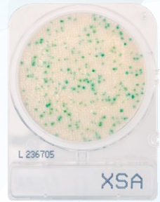
Staphylococcus aureus Cat. no. XSA100

Simplify data storage, sample entry, and reporting with the accessories below.