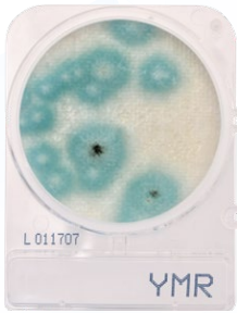
Yeast and Mold Rapid Cat. no. YMR100