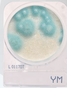
Yeast and Mold Cat. no. YM100