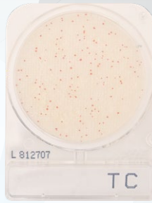
Total Count Cat. no. TPC100