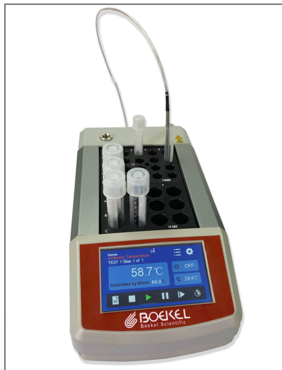
Two Block Unit with External Temperature Probe