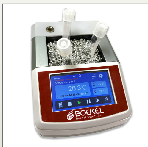
One Block Unit with Thermal Beads