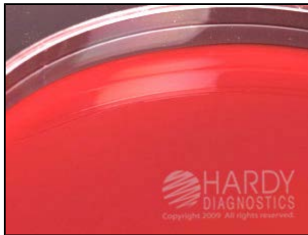
Uninoculated plate of AnaeroGRO™ Brucella Agar with H and K (Cat. no. AG301).