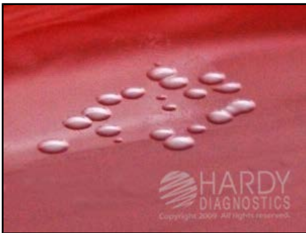
Peptostreptococcus anaerobius (ATCC® 27377) colonies growing on AnaeroGRO™ Brucella Agar with H and K (Cat. no. AG301). Incubated anaerobically for 48 hours at 35°C.