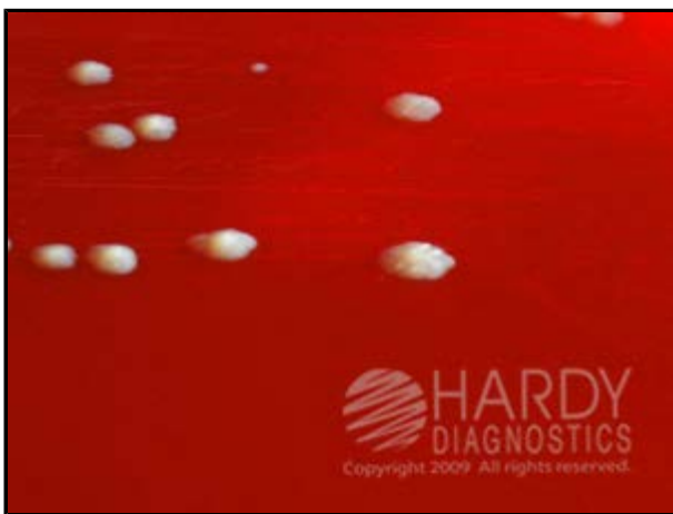
Fusobacterium nucleatum (ATCC® 25586) colonies growing on AnaeroGRO™ Brucella Agar with H and K (Cat. no. AG301). Incubated anaerobically for 24 hours at 35°C.

AnaeroGRO™ Brucella Agar with Hemin and Vitamin K should appear opaque, and medium to dark red in color.