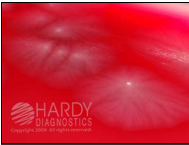
Porphyromonas levii (ATCC® 29147) colonies growing on AnaeroGRO™ Brucella Agar with H and K (Cat. no. AG301). Incubated anaerobically for 24 hours at 35°C.