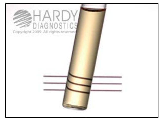
Uninoculated tube of BHI Broth (Cat. no. R20).