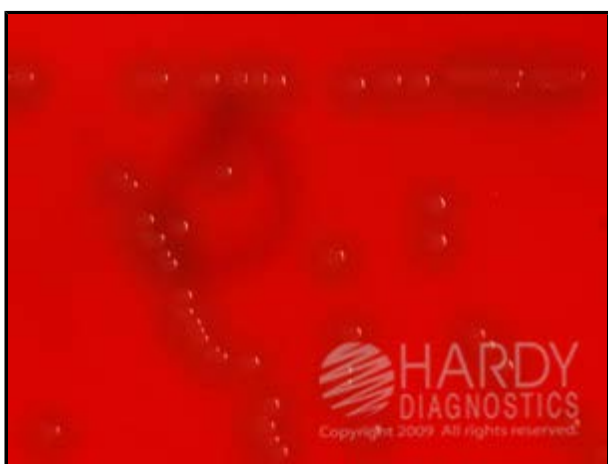
Streptococcus pneumoniae (ATCC® 6305) colony before incubation with Bile Spot Reagent (Cat no. Z61). Incubated aerobically for 30 min. at 35°C.