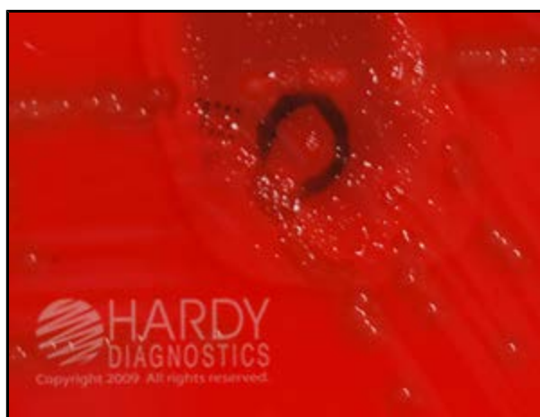
Streptococcus pneumoniae (ATCC® 6305) colony after incubation with Bile Spot Reagent (Cat no. Z61). Reagent was dropped within the black circle. Incubated aerobically for 30 min. at 35°C.