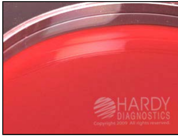
Uninoculated plate of Brucella Agar with H and K (Cat. no. A30).