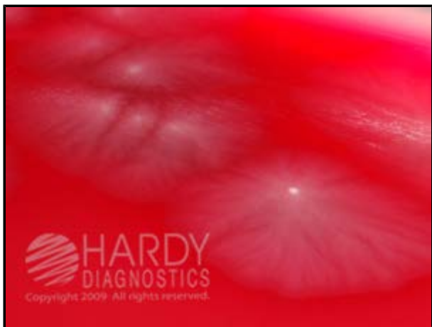
Porphyromonas levii (ATCC® 29147) colonies growing on Brucella Agar with H and K (Cat. no. A30) Incubated anaerobically for 24 hours at 35°C.