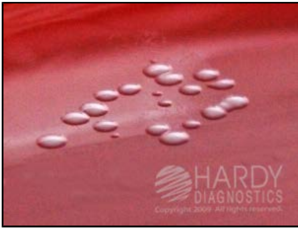
Peptostreptococcus anaerobius (ATCC® 27377) colonies growing on Brucella Agar with H and K (Cat. no. A30). Incubated anaerobically for 48 hours at 35°C.