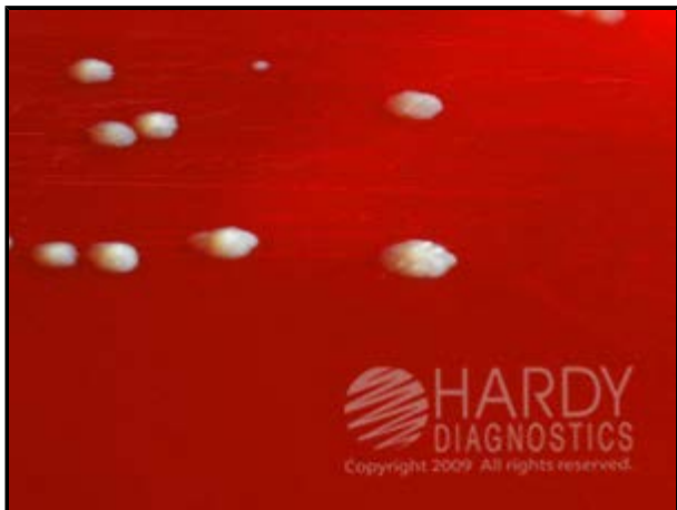
Fusobacterium nucleatum (ATCC® 25586) colonies growing on Brucella Agar with H and K (Cat. no. A30). Incubated anaerobically for 24 hours at 35°C.

Brucella Agar with H & K should appear opaque, and cherry red in color.