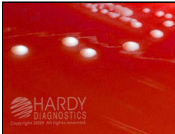
Bacteroides fragilis (ATCC® 25285) colonies growing on Brucella Agar with H and K (Cat. no. A30). Incubated anaerobically for 24 hours at 35°C.