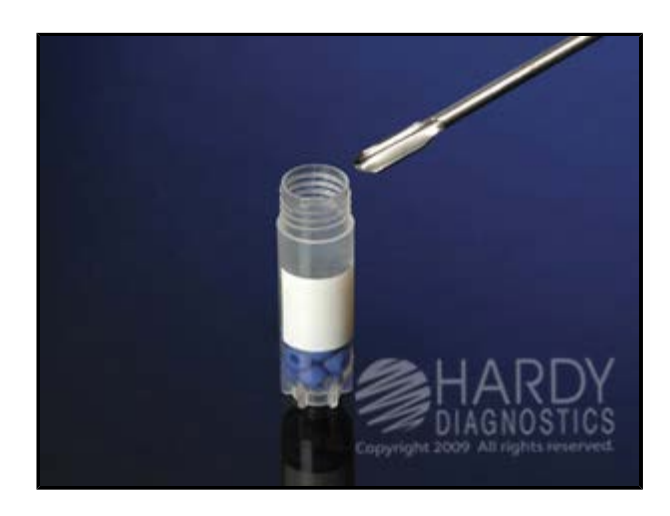
Cryo Saver^{TM}, \ Brucella \ Broth \ with \ Glycerol \ Vial \ with \ Beads.