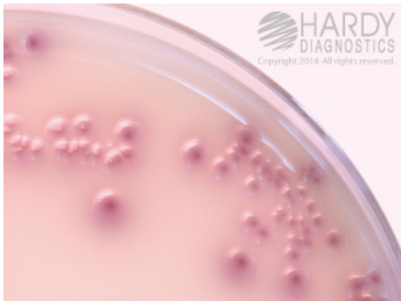
Escherichia coli O157 (ATCC® 35150) colonies growing on HardyCHROM™ O157 (Cat. no. G305). Incubated aerobically for 24 hours at 35 deg. C.

HardyCHROM™ O157 should appear opaque, and white to off-white in color.