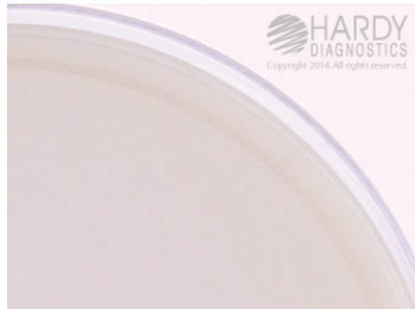
Uninoculated plate of HardyCHROM™ O157 (Cat. no. G305).