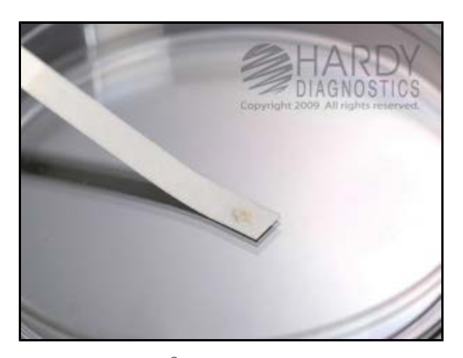
Escherichia coli (ATCC<sup>®</sup> 25922) applied to an OxiStrip<sup>™</sup> (Cat. no. Z93). No development of a blue/purple color within 10-20 seconds was indicative of a negative oxidase reaction.