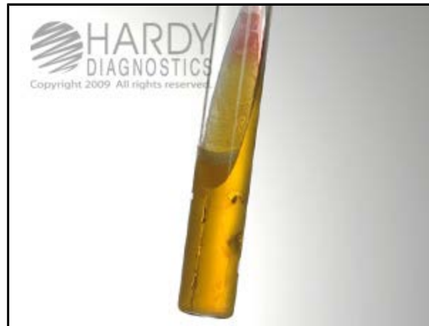
Escherichia coli ( ATCC® 25922) growing on TSI Agar (Cat. no. L50). Incubated aerobically for 24 hours at 35°C.