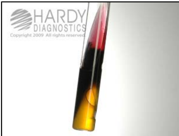
Salmonella enterica ( ATCC® 14028) growing on TSI Agar (Cat. no. L50). Incubated aerobically for 24 hours at 35°C.

Triple Sugar Iron (TSI) Agar should appear slightly opalescent, with a possible slight precipitate, and red in color.