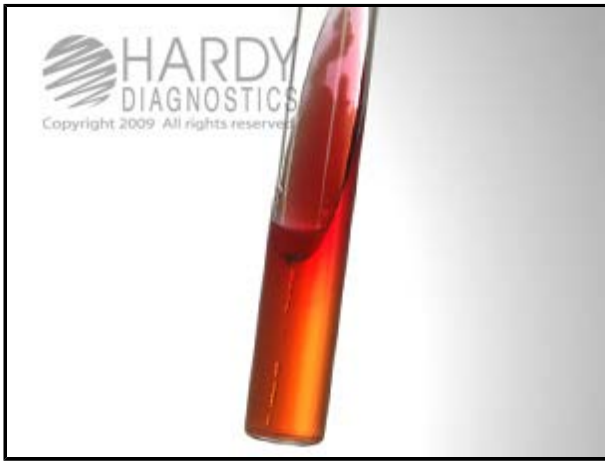
Pseudomonas aeruginosa ( ATCC® 27853) growing on TSI Agar (Cat. no. L50). Incubated aerobically for 24 hours at 35°C.