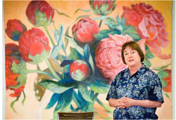
Figure 3: Salyers' speaking at a forum about the relationship between humans and microbes in 2006.

and the emergence of resistance, Salyers underscored the importance of implementing judicious antibiotic stewardship practices to mitigate the proliferation of resistant strains.